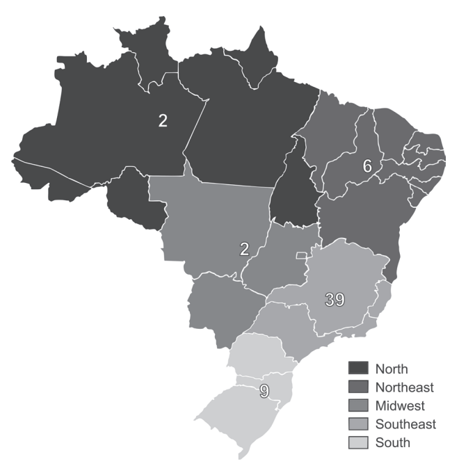
Figure 2. Distribution of CBAB students by Brazil.